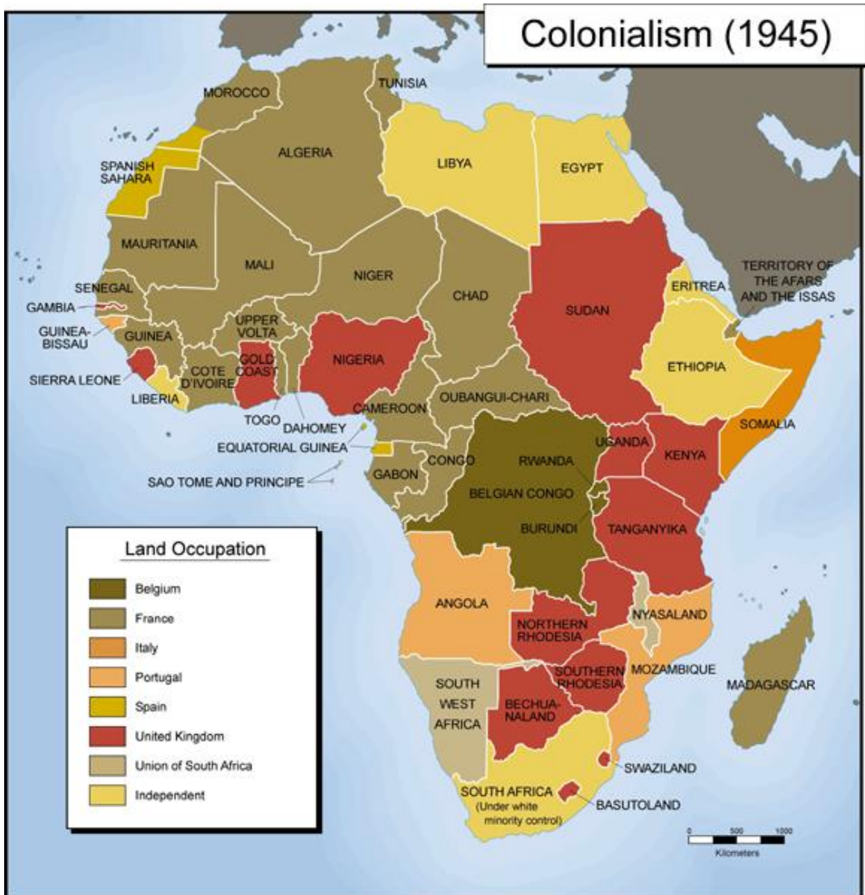
APPENDIX 1: Exploringafrica.matrix.msu.edu. (2018). Colonial Exploration and Conquest in Africa . [online] Available at: http://exploringafrica.matrix.msu.edu/colonial-exploration-and-conquest-in-africa-explore/ [Accessed 31 Jul. 2018].